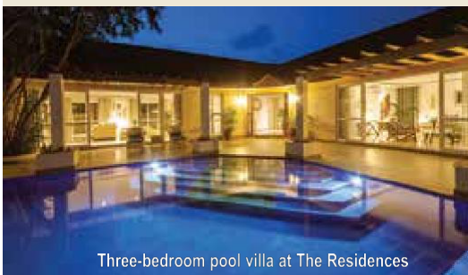
Three-bedroom pool villa at The Residences

Set in a peaceful corner of Leopard Beach Resort, The Residences is a distinctly up-market development of 28 fully serviced villas within 15 acres of tropical forest. The Residences offers four villa types - with private pools - each boasting a modern and spacious design, privacy and security, and a host of amenities that set a new benchmark for the region.